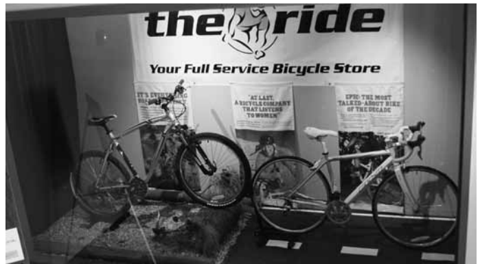
Window display created by UACCM visual merchandising students

UACCM retail marketing students created and installed window displays for several local businesses to be viewed on campus throughout the fall semester. The students of Nancy Patterson's Visual Merchandising class were divided into groups, which were given the names of local businesses for which they were responsible for creating a display. The students contacted the local business to discuss the project. When the time came for a team to install their design in the window, they were able to completely construct the display in one day. These displays were shown in the specially designed window display area on the first floor of UACCM's Business Technology Center. This was an excellent opportunity for the Visual Merchandising students to get hands-on experience while providing on-campus exposure for local businesses. The students demonstrated their high levels of creativity and ingenuity as they managed to transform a small window space into displays that resembled a mountain bike trail, a photography studio, an antique-filled living room, and even a football field.